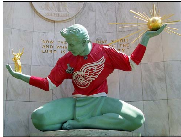
*Michigan Landmark - "The Spirit of Detroit"

"Now the Lord is that Spirit: and where the Spirit of the Lord is, there is liberty." (2 Corinthians 3:17)